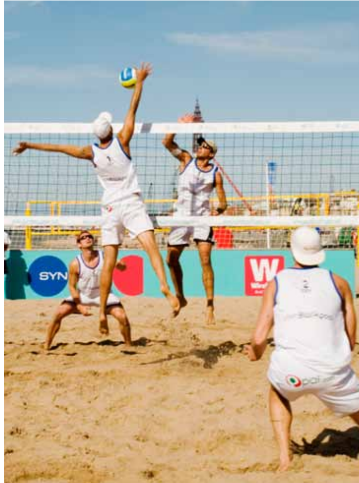
Left: Volleyball Championships Below: Everyday play

Volleyball Championships: 10th to 20th Sept 2009